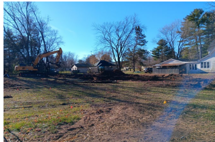
Excavating work: S & G