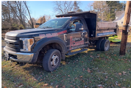
Concrete work: Brothers Concrete Construction